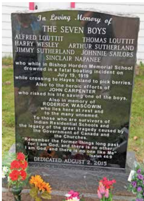
This headstone is a memorial to the seven boys of Bishop Horden School who lost their young lives in the summer of 1919.