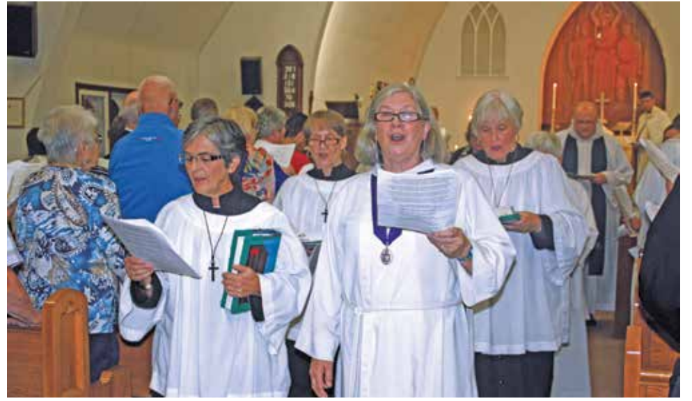
The voices of St. Peter's on-the-Rock's choir reflected their great enthusiasm and love of the occasion. They were well supported by the congregation.

Ordination continued from page 1. Pete's is blessed with a gifted organist who composed a postlude especially for Catherine and with enthusiastic singers, and that night with all the visitors' voices added in, it felt like our beautifully acoustic building lifted an inch or two from all the joyous sound. Then there was the lovely quiet contrast of a flute and guitar praising the joy of 'Simple Gifts'.