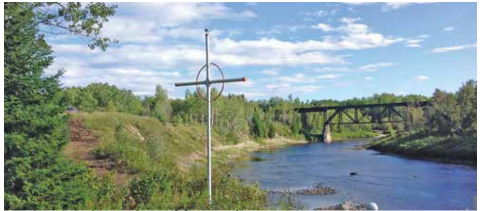
The very beautiful Pagwachuan River, Pagwa, Ontario.

This much loved ancestral ground continues to be maintained by individuals as well as by the CFLN Band Council; all of whom are involved with significant efforts to preserve this historic site. Band members from all over make regular trips to Pagwa throughout the year and not just for hunting, trapping, and fishing but also for sacred purposes as well. Having been there on three occasions providing support as their priest, I have found that Pagwa is indeed a very special place and there I have found my own connection to the land.