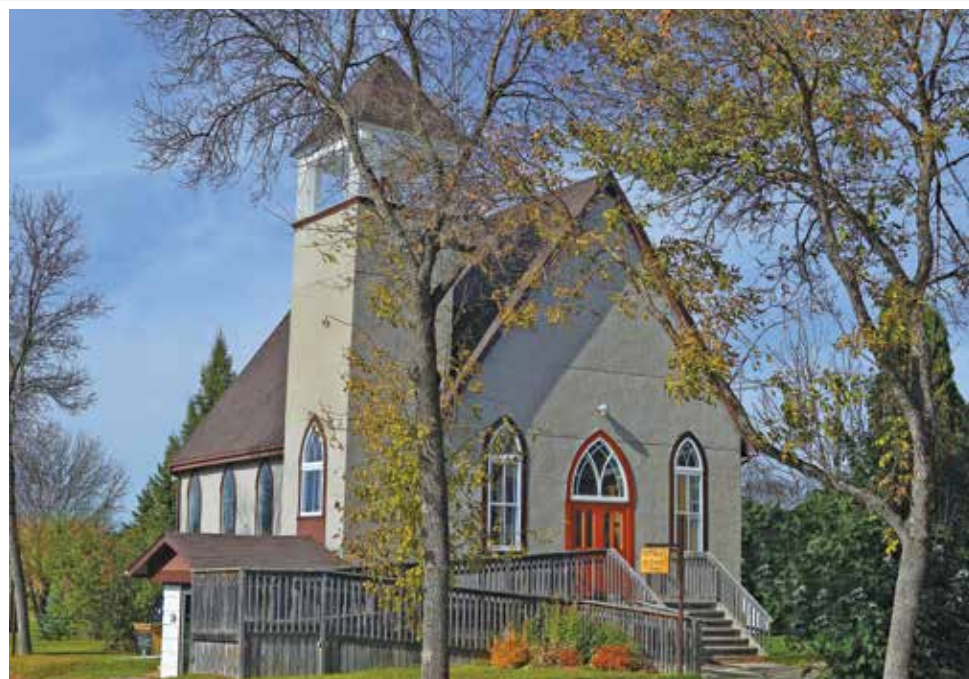
St. Mark's, Iroquois Falls, Ontario received tender loving care from its people.

This is just one ministry of the diocese that focuses in a very real way upon its mission statement: "Called to Live and Proclaim the Gospel."