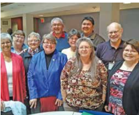
The Diocese of Moosonee was ably represented by a team of clergy & laity.