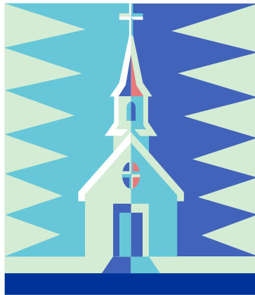
The Anglican Diocese of Quebec 2005